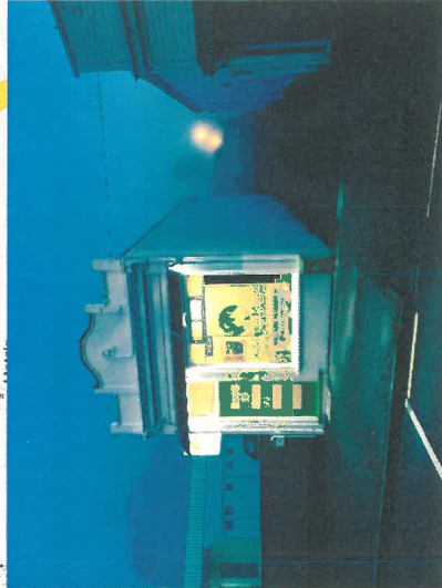
Fajar at Ad-Deen Mosque in Taihape, New Zealand

“WHOEVER BUILDS A MASJID FOR THE SAKE OF ALLAH, ALLAH WILL BUILD FOR HIM A HOUSE IN PARADISE” [Sahîh al-Bukhârî and Sahîh Muslim]